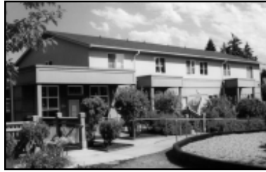
DISTRICT 44: EASTERNWOOD FAMILY HOUSING, BOTHELL, LOW INCOME (LATCH)