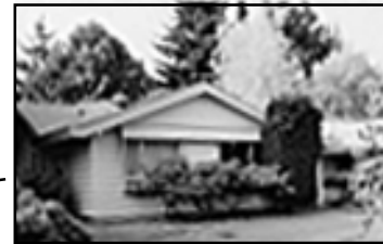
DISTRICT 48: PARKVIEW HOMES FOR EXCEPTIONAL CHILDREN, BELLEVUE, DEVELOPMENTALLY DISABLED YOUTH (PARKVIEW SERVICES)