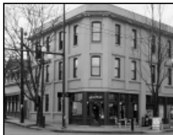
DISTRICT 37: COLUMBIA HOTEL, SEATTLE, LOW INCOME IN MIXED-USE BUILDING (SEED-SOUTH EAST EFFECTIVE DEVELOPMENT)