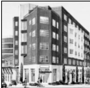
DISTRICT 36: PLYMOUTH PLACE, SEATTLE, FORMERLY HOMELESS ADULTS (PLYMOUTH HOUSING GROUP)