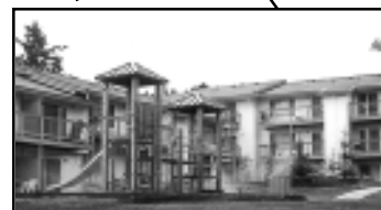
DISTRICT 33: WINDSOR HOUSE, SEATAc, LOW INCOME FAMILIES (KING COUNTY HOUSING AUTHORITY)