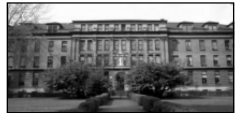
DISTRICT 43: GOOD SHEPHERD CENTER, SEATTLE, ARTISTS LIVE-WORK STUDIOS (HISTORIC SEATTLE)