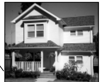
DISTRICT 37: NOJI GARDENS, SEATTLE, HOME OWNERSHIP (HOME SIGHT)