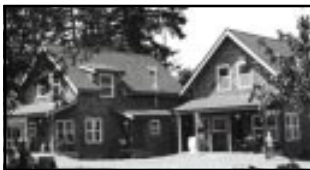
DISTRICT 34: VASHON CO-HOUSING, VASHON ISLAND, HOME OWNERSHIP (COMMON GROUND)