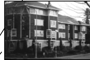
DISTRICT 45: FAMILY VILLAGE, REDMOND, HOMELESS WOMEN WITH CHILDREN (YWCA)