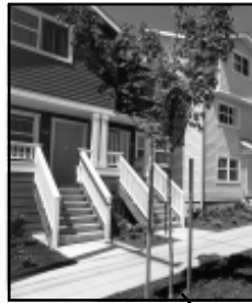
DISTRICT 46: DENICE HUNT TOWNHOMES, SEATTLE, LOW INCOME FAMILIES (LOW INCOME HOUSING INSTITUTE)