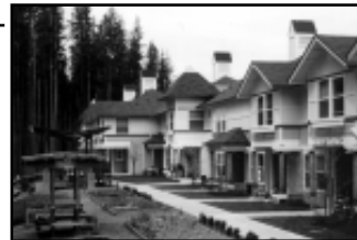
DISTRICT 5: HIGHLAND GARDENS, ISSAQUAH, LOW INCOME (ST. ANDREW'S HOUSING GROUP)