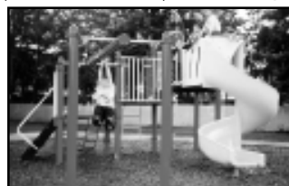
DISTRICT 31: AUBURN MANOR APARTMENTS, AUBURN, LOW INCOME FAMILIES (LOW INCOME HOUSING INSTITUTE)