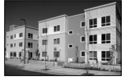
DISTRICT 41: ASHWOOD COURT, BELLEVUE, LOW-INCOME SENIORS (DASH-DOWNTOWN ACTION TO SAVE HOUSING)