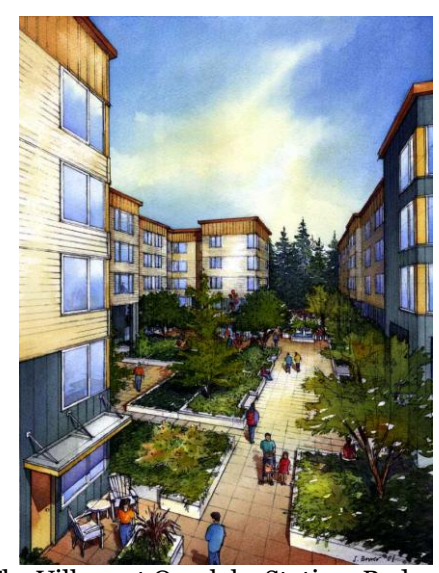
The Village at Overlake Station, Redmond

"The Voice for Low Income Housing in King County"