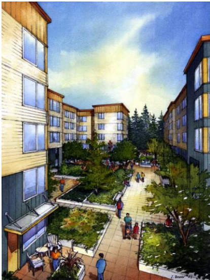
The Village at Overlake Station, Redmond

“The Voice for Low Income Housing in King County”